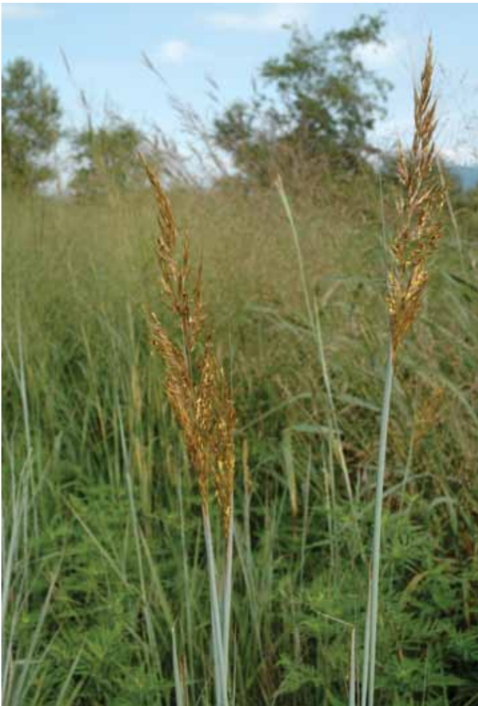
Fig. 5. Indiangrass can be recognized by its pale green stems and golden head. The seedhead appears in August, later than the other NWSG.