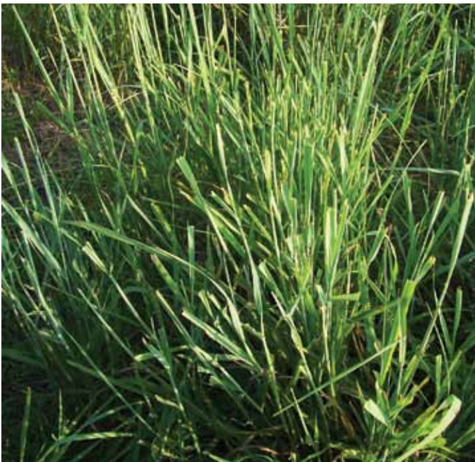
Fig. 8. Without adequate grazing pressure, NWSG, especially switchgrass (above), can become too stemmy and forage quality will decline.

During the first 6 – 8 weeks of the growing season, forage production from these grasses is quite impressive. Often, producers do not stock heavily enough and the forage gets ahead of the cattle, at which point it becomes mature and stemmy (Fig. 8). Allowing the forage to get more than 30 inches tall will make grazing management difficult, particularly during the early portion of the summer, and forage quality will be reduced. When NWSG reach the appropriate height to initiate grazing (see When Do I Start Grazing , on page 6), you may still have ample forage in your cool-season grass pastures. In that case, you will need to make a decision on which forage you should use based on the class of animals (cow-calf, heifers, steers, etc.) you are grazing and their nutritional needs. Be prepared to harvest unused forage on the pasture that you do not graze.