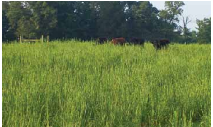
Fig. 3. This 2-year-old stand of big bluestem and indiagrass is providing excellent summer forage with gains of more than 2.2 lb per day on 600 - 800 lb steers.