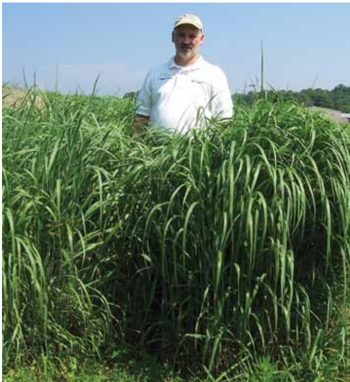
Fig. 2. This 18-year-old stand of cave-in-rock switchgrass continues to produce large volumes of quality forage.

As with any forage, hay quality is strongly influenced by timing of harvest. Harvest of NWSG at late-boot stage will typically produce hay with protein levels of 10 percent or higher. However, like most warm-season forages, NWSG will test at levels below those for cool-season forages harvested at a comparable maturity level. This is partly because proteins in NWSG do not break down as quickly during ruminant digestion and bypass the rumen; thus, they are referred to as “bypass proteins.” Because bypass proteins can be absorbed in the intestines, animal performance on NWSG exceeds what we would predict based on forage sample analysis. For example, when grazed, NWSG routinely produce from 1.5 – 2.5 lb of daily gain in steers (Fig 3). Furthermore, NWSG forage quality is not diminished by endophyte fungi, a substantial problem with tall fescue.