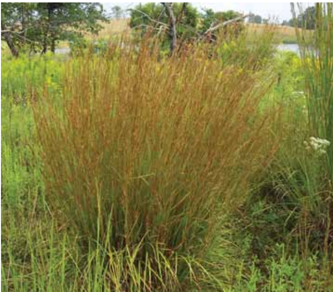
Fig. 6. A mature clump of little bluestem, a smaller bunch grass that often shows a reddish hue on its stems. Note the mature big bluestem plant in the background on the right. Despite its smaller size, little bluestem can produce desirable forages – even on poor ground.

A more recent release, OZ-70 was developed from plant material collected from a number of locations in the Mid-South. As such, it is one of the first varieties of big bluestem from this region. Like other varieties of big bluestem, it has wide site adaptation, but will not tolerate flooding as well as switchgrass.