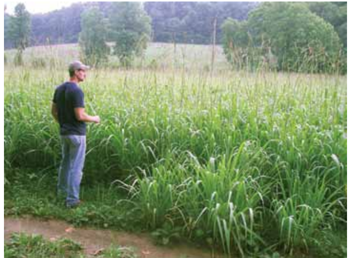
Fig. 8. Eastern gamagrass produces impressive yields of quality forage. Its seedheads appear in June and are quite distinctive.

Like switchgrass, eastern gamagrass produces very high yields and tolerates wet sites (Fig 8). It begins spring growth sooner than the other NWSG and also maintains growth later in the season than the other species – with the exception of indiangrass. It can support high stocking rates due to its high productivity.