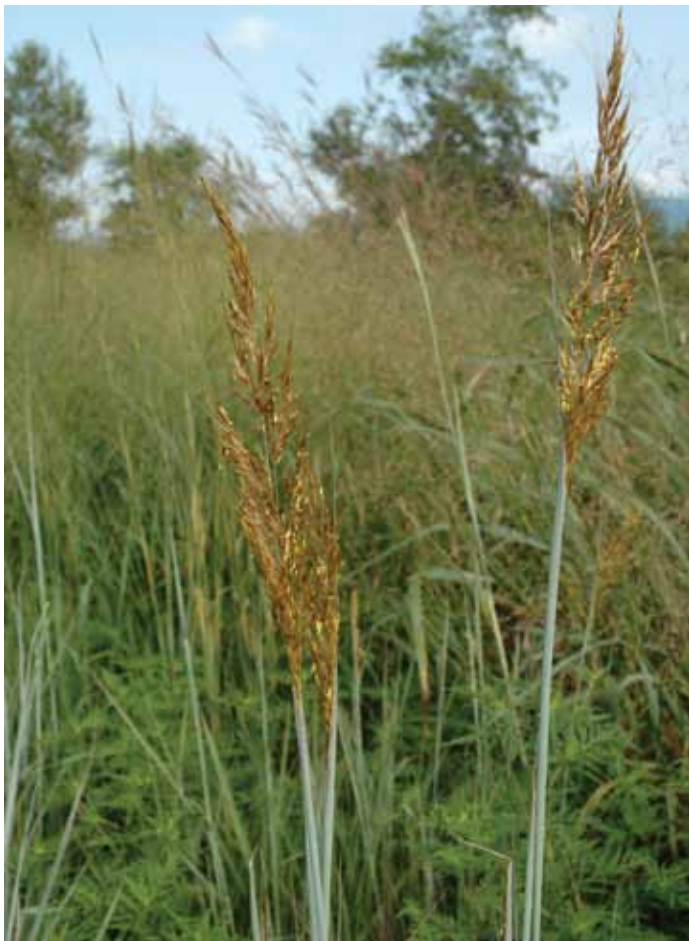
Fig. 7. Indiangrass is easily recognizable by the blueish hue of its stems and the large yellow seedheads. Indiangrass is the latest of the NWSG to produce seedheads; typically they appear in July and August.

Probably the most widely used variety in the Mid-South, Rumsey was developed from plant material from south-central Illinois. It produced yields similar to Cheyenne in variety trials conducted by the University of Kentucky.